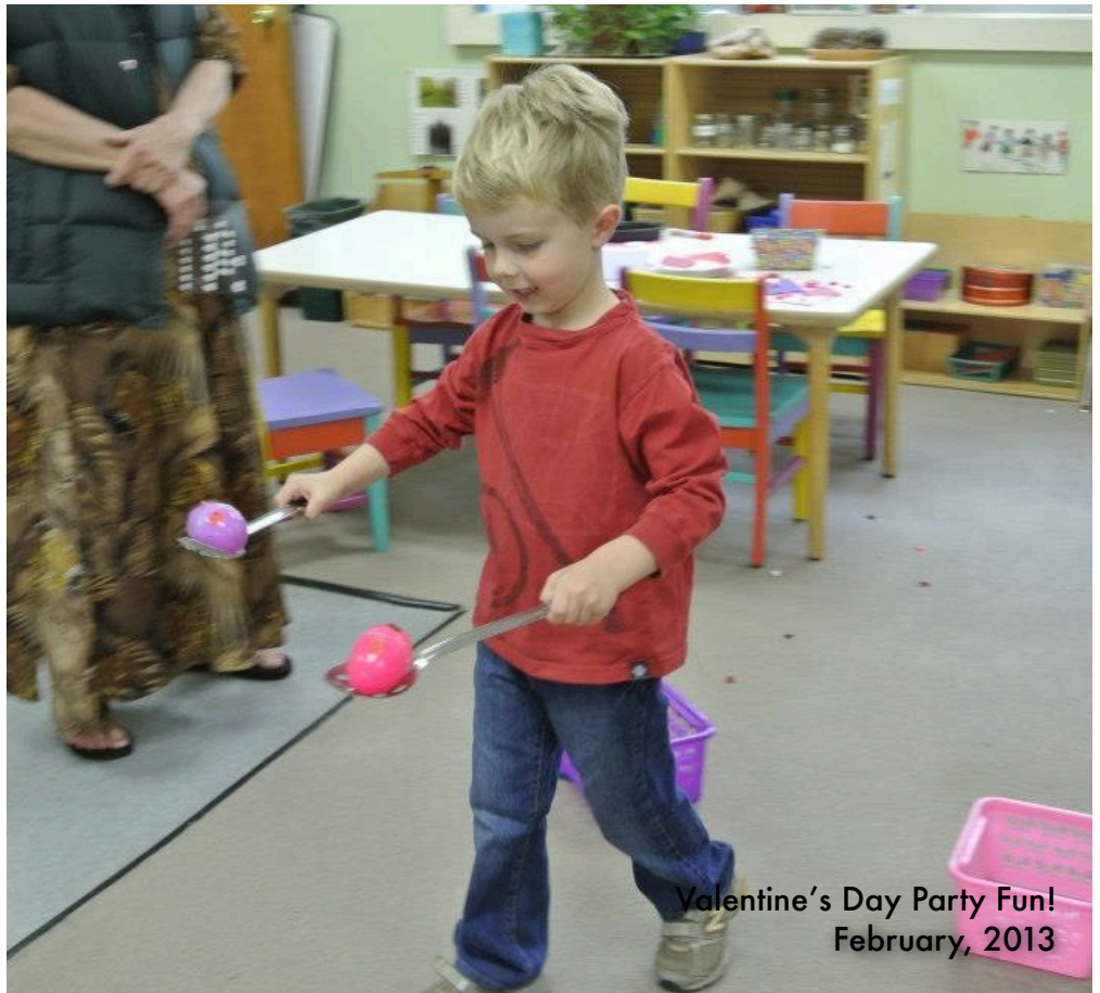
Valentine's Day Party Fun! February, 2013